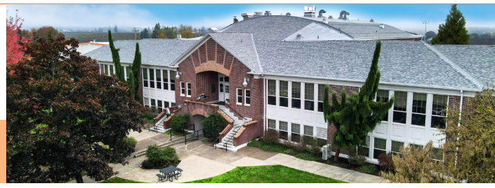
Yamhill Carlton High School